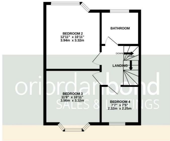
1ST FLOOR 423 sq.ft. (39.3 sq.m.) approx.